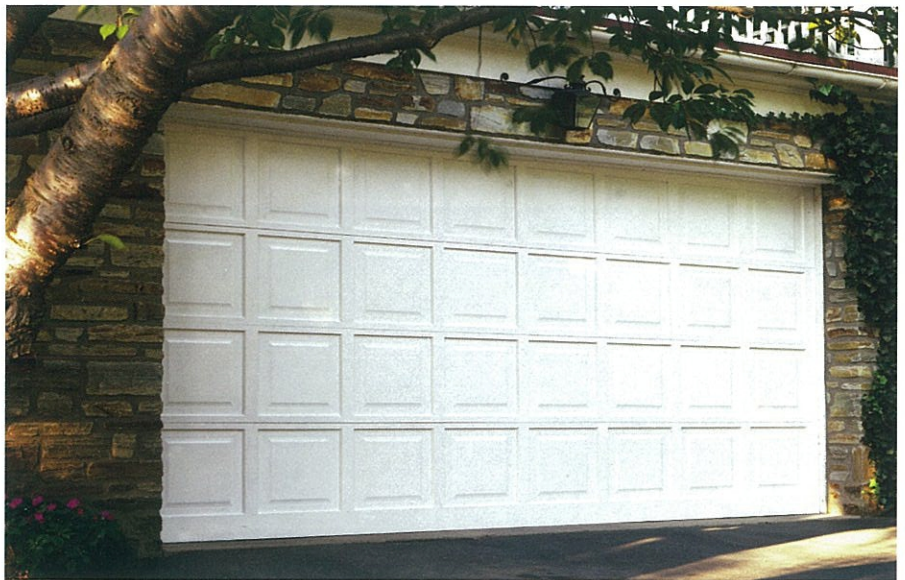
Above: 2-car Cladwood Raised Panel Door

Since 1947, General Doors has maintained a reputation for reliability, service and value to distributors and installers throughout the eastern U.S. This vast experience, combined with the latest engineering and manufacturing technology, has produced the Cladwood Raised Panel Door.