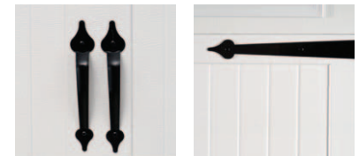
Flat Black Handles