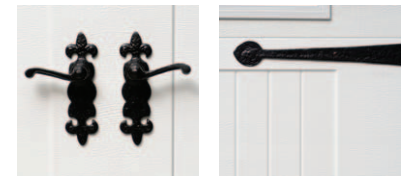
Wrought Iron Handles